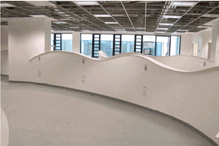
Maternity & Oncology Unit, North Staffordshire Hospital (During Construction)

Like all mineral paints, Keim Concretal Lasur does not contain any harmful solvents, VOCs or plasticisers and is suitable for use in medical environments and hospitals.