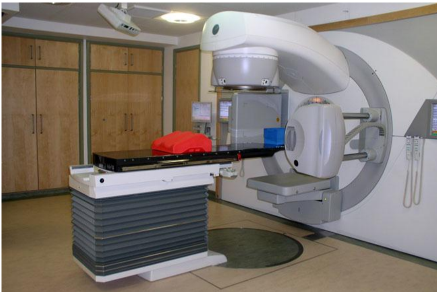
Royal Marsden Radiotherapy Unit

In sterile and healthcare environments the reduction and removal of dead or living biomass is important to prevent infectious contaminations. Dead cells still have a toxic and allergic potential, Keim Ecosil-ME improves interior hygiene more effectively than a conventional emulsion paint.