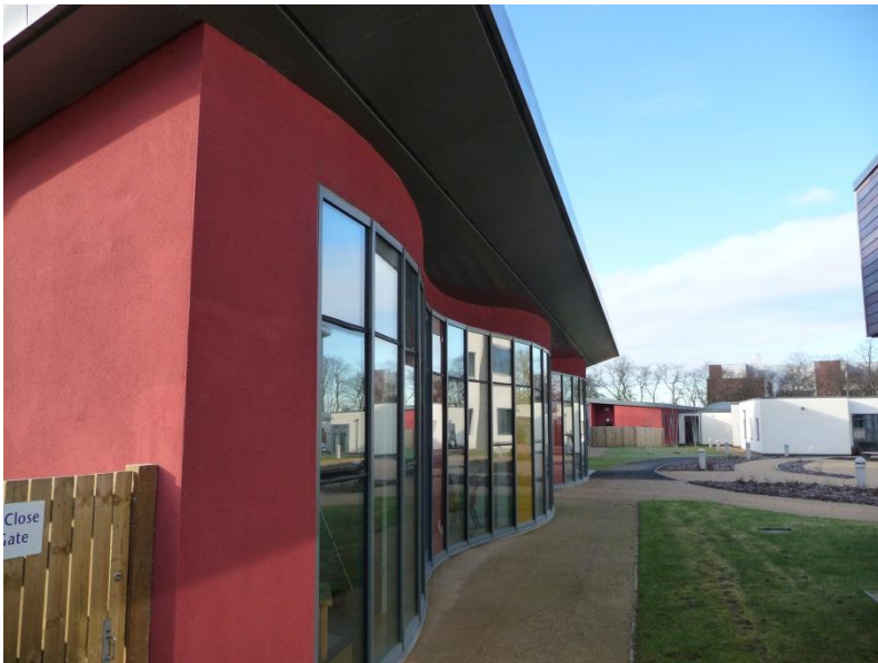
Stobhill Hospital, Glasgow

Keim Soldalit-ME is a photocatalytic mineral paint, for external application and like Keim Ecosil-ME helps to improve air quality and reduce atmospheric nitrogen oxide pollution.